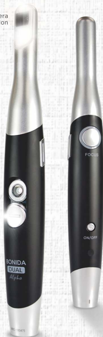
Extra-oral Camera Section